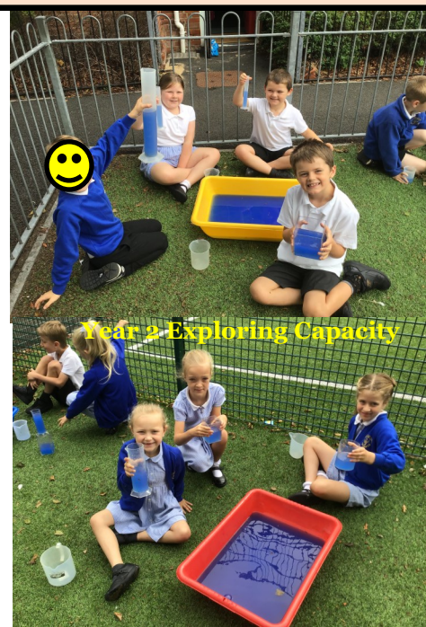
Year 2 Exploring Capacity