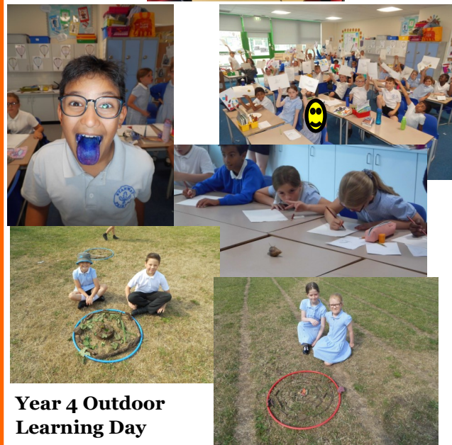
Year 4 Outdoor Learning Day