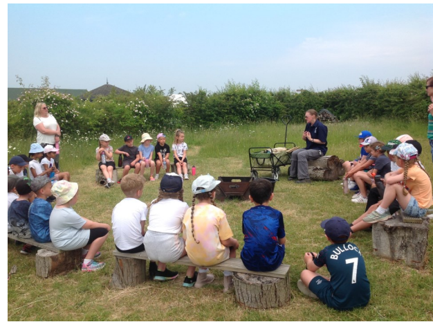
Year 3 at Abberton Reservoir