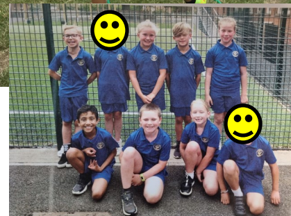
Year 3/4 Kwik Cricket Team