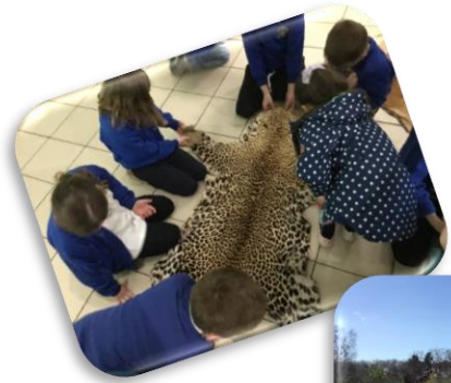
Year 2 Zoo Trip