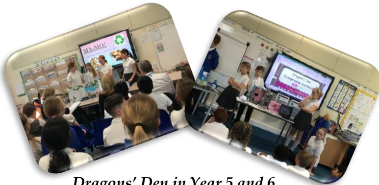
Dragons' Den in Year 5 and 6