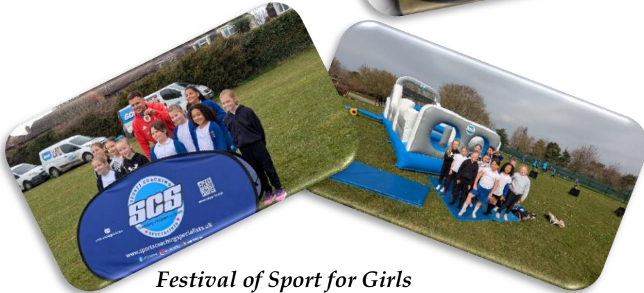
Festival of Sport for Girls