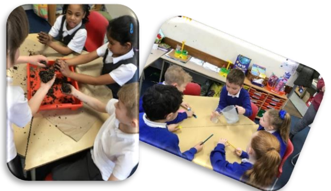
KS1 Seed Bombs