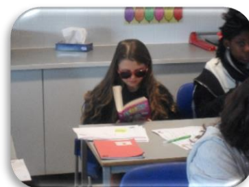
World Book Day