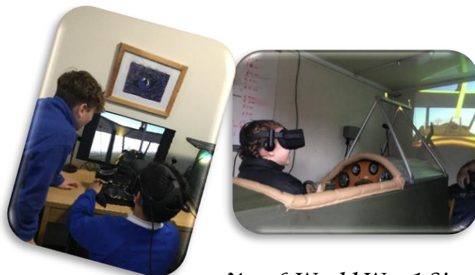
Year 6 World War 1 Simulator Day