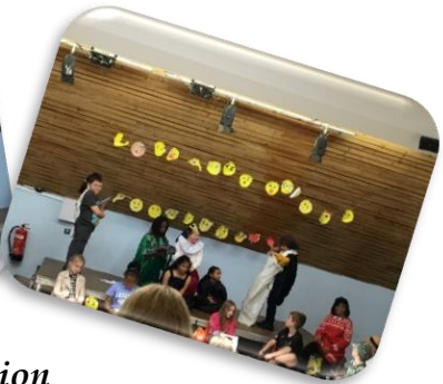
Year 4 Production